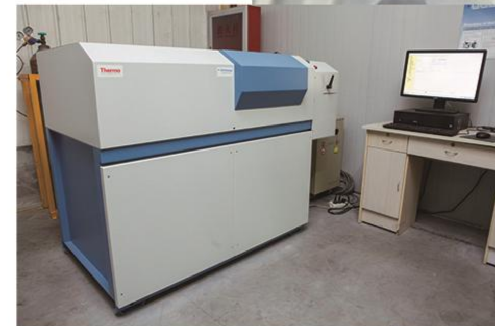
金属分析仪 Metal analyzer