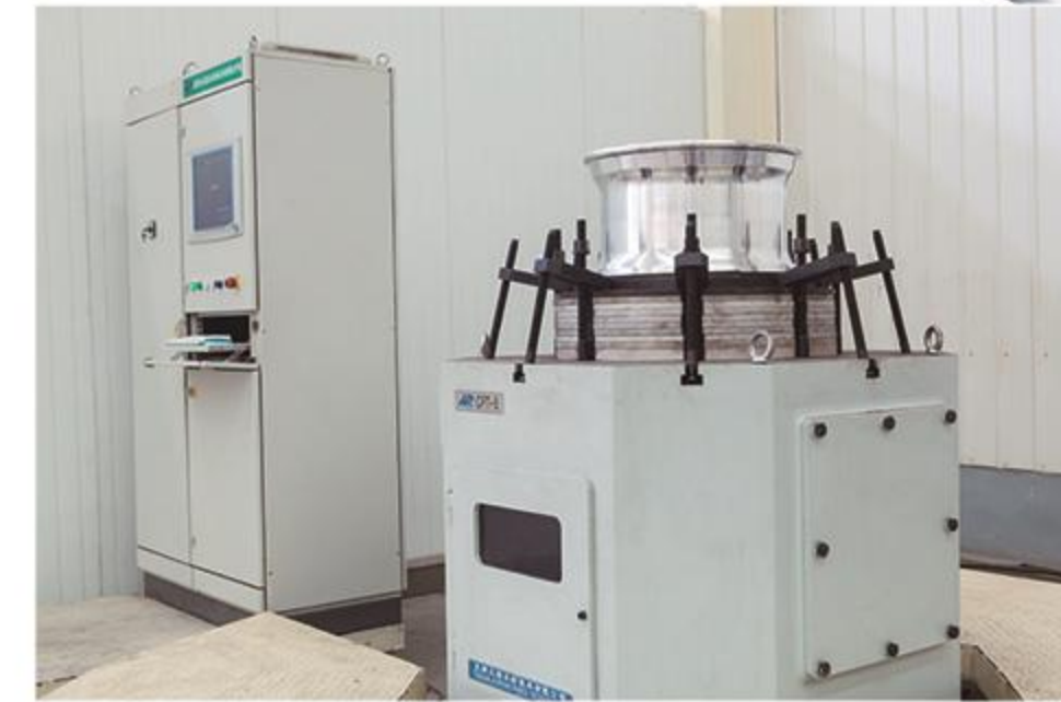
车轮弯曲试验机 Bending tester of vehicle wheel

面对质量问题零容忍、零妥协是正宇的自我要求，为此成立国家级检测中心，承担了产品把控、检测技术改进、先进技术研究的任务，使得产品都能代表正宇的形象与品牌力量。