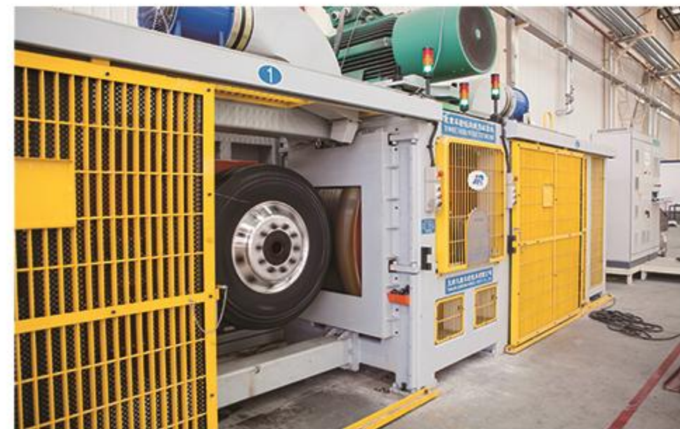
径向疲劳试验机 Radial fatigue testing machine

In order to closely follow the world technology trend, and to constantly strengthen and improve the manufacturing level of steel wheels, the company has gathered the experienced engineers team of industry and has built the independent technology research and development center, has formed a whole set of the wheel development and production technology which accords with the self-characteristics, and has promoted the production technology to lead the trend of the time.