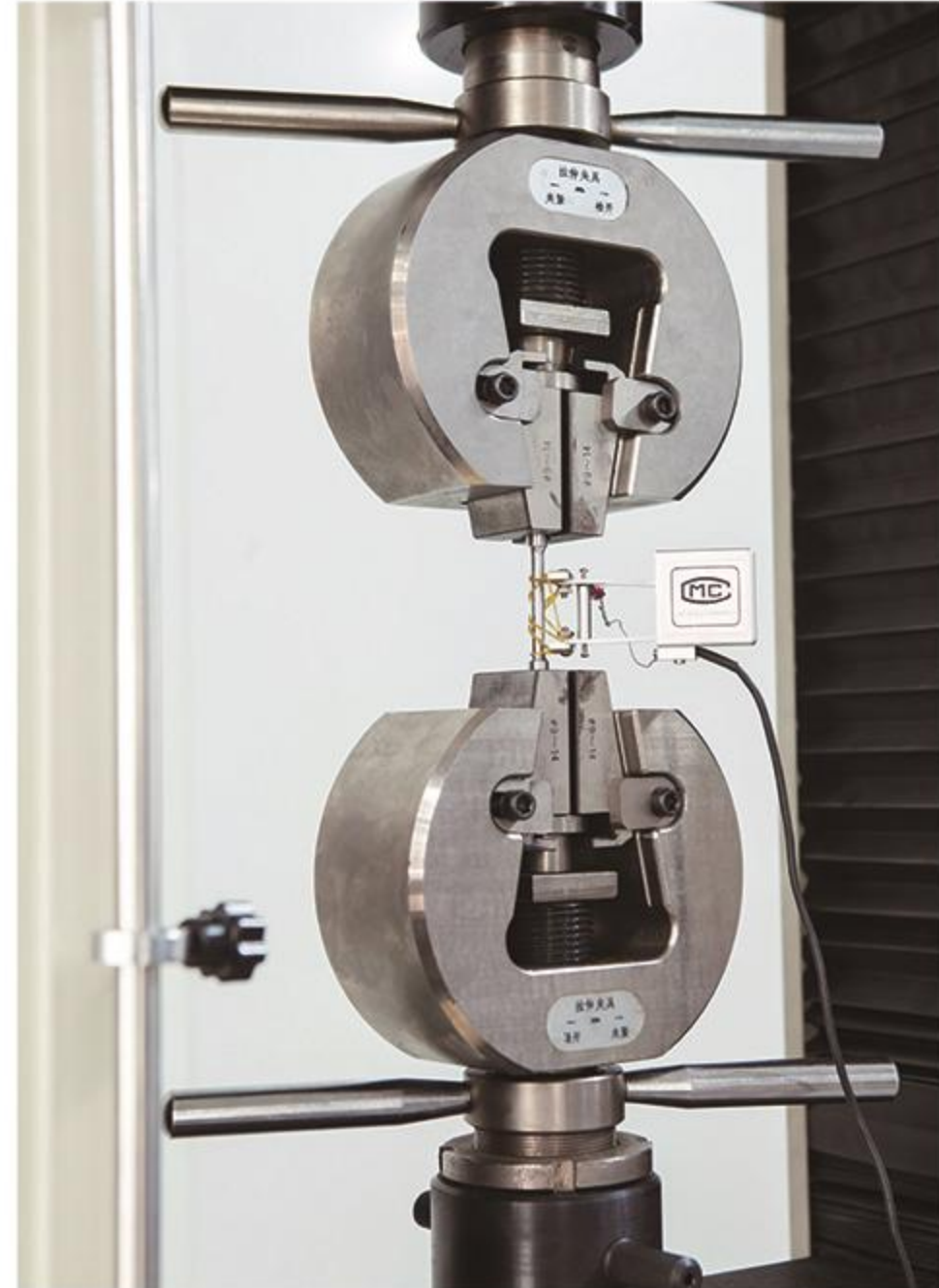
材料拉伸试验机 Material stretch test machine