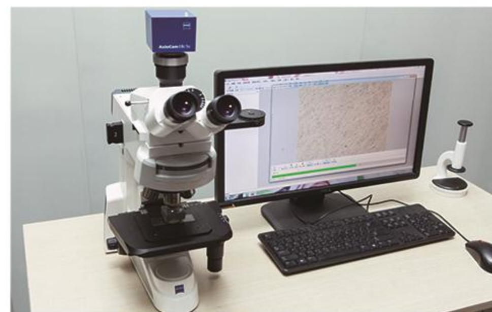
金相显微镜 Metallographic microscope